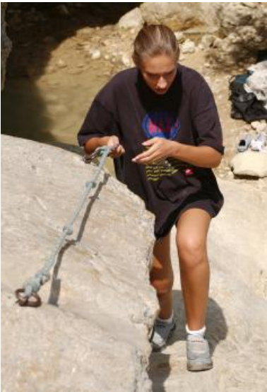
...and then into the mountains!

1:30 p.m.: A small problem arises. My new notebook had shovelled the picture data onto its hard drive for the last hour or so to make room on my memory cards, causing the notebook's rechargeable batteries to give up on me. Darn! Now I am standing here with a notebook that doesn't work and four memory cards that are full and can't be emptied. Full of regret because I could have spent all afternoon at this location, I decide to call it a day.