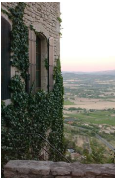
High above the valley of Apt: the fortress city of Gordes.