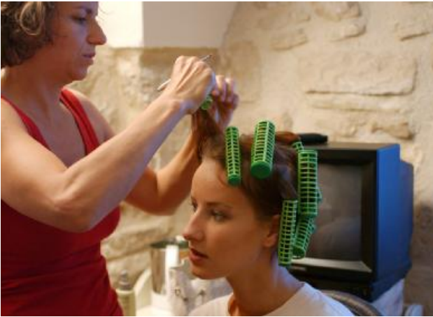
Preparing for the first shoot.