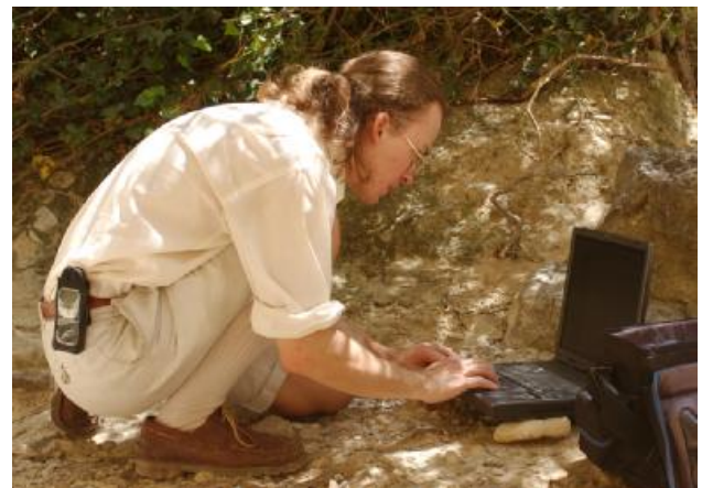
At the nicest moments, the computer fails!