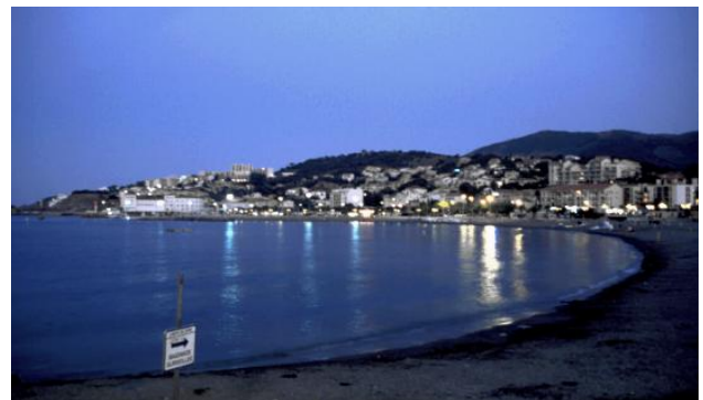
Romantic: the bay of Banyuls at night.