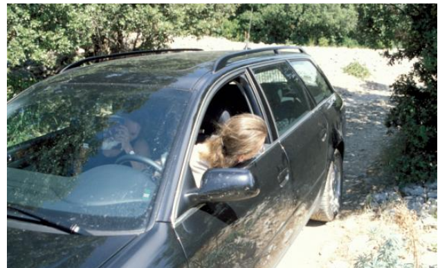
Return journey: wide is the car, narrow is the path.

once again back to the river, but in the meantime, we are no longer alone there: a sizable swimming bustle has taken over. In spite of this, I quickly shoot a couple of rolls of film with Vanessa. The French are tolerant; in this country, one can get away with a few things in this respect! The only problem is, I need to have the picture background free, which restricts me a bit. After a half hour, it gets too full for us anyway.