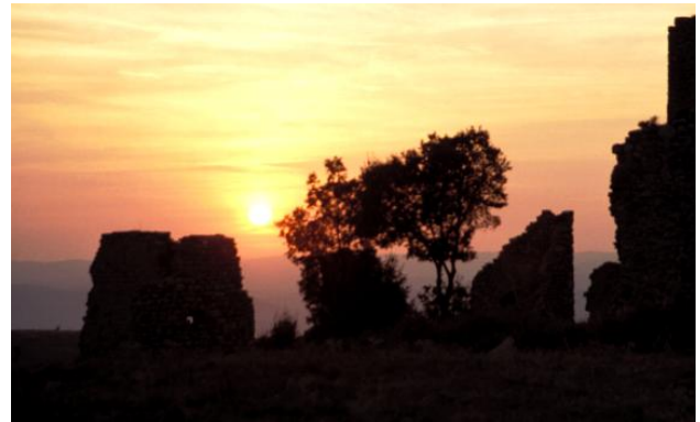
The old ruins says goodbye magnificently.

9:15 p.m.: Finally done for today. We still have to drive a whole hour to get to the hotel. Actually, we wanted to have a little bite to eat; but now, nobody wants to anymore and would like to just go to bed. I have a guilty conscience because I torture my people so. Still, the hotel is very pretty, situated directly on the marketplace in a little town.