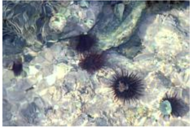
The horror of the Cote Vermeille: sea urchins!

urchins are making life hard for us. There are so many that you can only move about with great care.