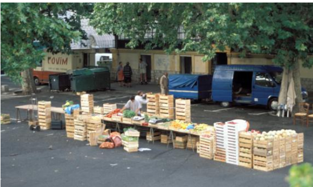
Early morning in a small French town: the market men are already at work.