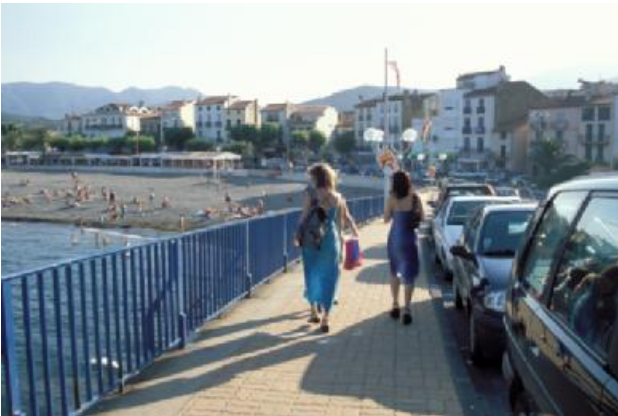
Finally in the south! First, off to the beach.

6:30 p.m.: However, we don't want to spend the evening here. We drive to Banyuls, a place in a picturesque setting in a bay on the coast. The girls are excited: much sea, much view and a strong atmosphere. We swim a little, then we go to one of the restaurants on the beach promenade and eat fish and seafood.