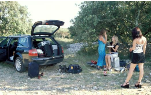
Base camp at the fortress.